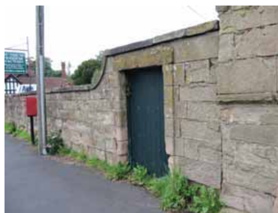
Wall to Tardebigge Court