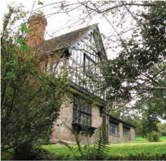
Papermill Lodge, off Hewell Lane

The area to the Southeast of the Crown owned land contains several notable historic buildings including the former estate kennels and papermill buildings.