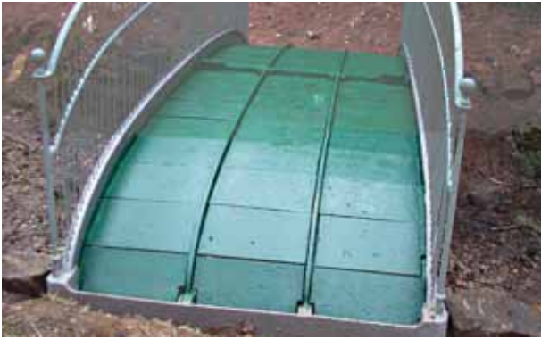
Iron bridge, Hewell Park 2009.