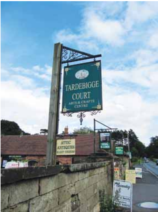
Tardebigge Court, Hewell Lane

The proposed Hewell Grange Conservation Area includes the area currently designated as a Registered Historic Park, the immediate surroundings of the former Paper Mill and Kennels to the Southeast of the prison, and the properties within Tardebigge village. This boundary was suggested and supported by the Victorian Society and the Hereford and Worcester Gardens Trust, to encompass what remains of the historic Hewell Grange estate. A map of the proposed Conservation Area boundary is attached as Map 1, a map of the existing Registered Historic Park boundary is attached as Map 2.