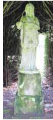
Coade stone statue in French garden, Hewell Park

Several statues and boundary features within the grounds of Hewell Grange are statutorily listed including the four Coade stone statues depicting the four seasons within the French garden which date from the 1820's, and the 1825 statue of the 'Fallen Gladiator' within the forecourt. The red sandstone walls and ornate piers enclosing the semicircular forecourt are Grade II listed and were constructed in 1902 to enclose the entrance to the Grange. To the left of the forecourt slightly down hill is the Grade II listed Icehouse, now completely covered in ivy. Beyond this to the West are the Quarry Gardens which includes a late 19th century, Grade II listed stone swing door and portal plus a stone seat, sandstone arch and remains of a Coade fountain which are all curtilage listed structures. To the rear of the house around the French Garden are several sets of stone steps, the remains of a Coade fountain and surrounding wall with urns, and a timber dovecote dating from 1907 which are all protected as curtilage listed structures.