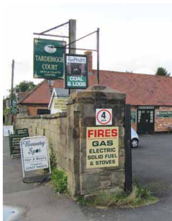
Signage at Tardebigge Court