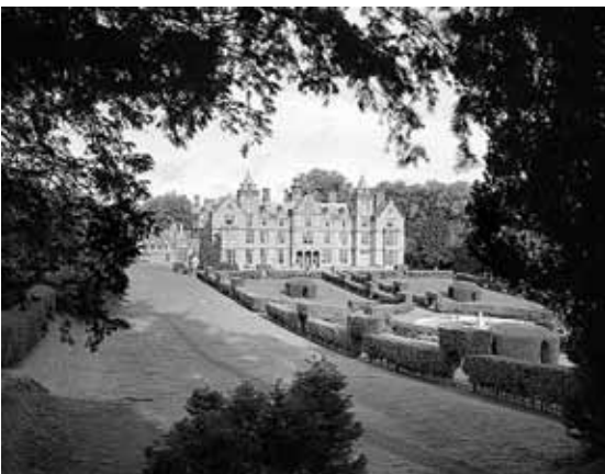
Hewell Grange garden front 1995.