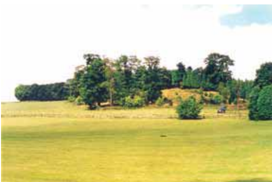
View across Hewell Park