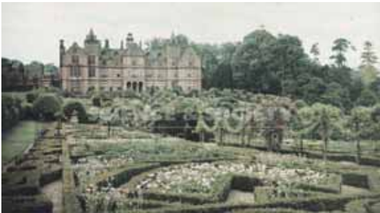
Hewell Grange garden front c.1910, Arthur E Morton

The gardens and park at Hewell Grange are in fact the most recent manifestation of a history of landscaping undertaken at the behest of the Earls of Plymouth. Among the most outstanding elements of the history still visible on the site are the improvements to the lake undertaken at the advice of William Shenstone; the lakes later remodelling with extensive tree planting undertaken by Lancelot Brown in the second half of the 18th century and the continuing enhancement of the pleasure grounds and park in the early 19th century by Humphrey Repton. The improvements also embrace the architectural improvements undertaken after 1815 by Thomas Cundy (Snr), firstly to the house and possibly including the creation of the Real Tennis Court. Further ornamentation to the pleasure grounds and the creation of extensive formal gardens were completed during the 19th century, culminating in improvements undertaken at the end of the century and beginning of the 20th century in conjunction with the design for the new house by Bodley and Garner, constructed between 1884 and 1891. Much of the historic design in terms of circulation patterns, structures, details of surface finish, planting and water features, has been eroded, replaced, or is in poor condition