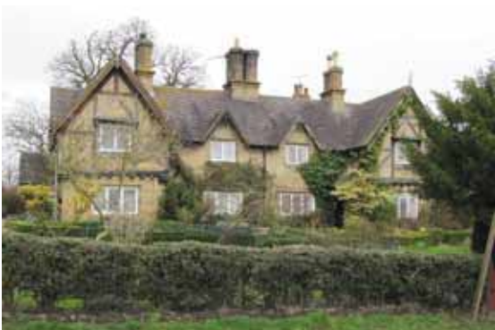
Park Cottages, Hewell Lane

The walled kitchen garden on Holyoakes Lane (now the Prison kitchen garden and shop) was laid out in 1827 and enclosed by a 3m high red brick wall in 1833. This site was once part of Holyoakes Farm, but relocated the kitchen garden away from the main house to allow the creation of the French garden in 1827. Attached to the walled garden facing Holyoakes Lane, is the much altered former Head Gardeners Cottage (pre 1838) and Apple Store (1850s) which interestingly resembles the typical design of a non conformist chapel. Within the walled garden a number of historic structures survive including one 1830s glasshouse, an 1840s Pineapple House, an 1840s Root House and a series of single storey outbuildings also 1840s. The kitchen garden was added to the registered park in 2001, it is also proposed that the walled garden be submitted for statutory listing in recognition of its architectural and historic interest.