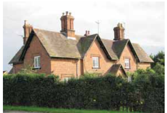
Rose Cottages, Hewell Close

Rose Cottages now front onto the car park of the Tardebigge public house which was designed by Francis Baylis of Redditch and built in 1911 as a village hall and institute. The building was constructed in memory of the Earl of Plymouth's eldest son who died in Agra, India and was used as a recovery hospital for WWI soldiers. Built in red brick with a slate roof and central cupola feature to the front elevation, this historic building has considerable presence in the streetscene and in views through the Conservation Area as well as having social historical significance.