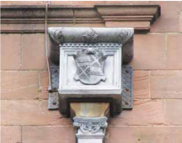
Windsor family coat of arms

Tardebidge as a settlement can be traced back to the 10th century and various versions of the name are recorded. The name can be translated as 'tower on the hill' - a possible reference to an earlier ecclesiastical building on the site of St. Bartholomew's Church. The majority of the manor including the previous church was given to the Cistercian Monks at Bordesley Abbey c.1138 and reportedly grew to a much larger settlement through the medieval period. The medieval church was demolished in 1775 and replaced with the current Grade II listed church in 1777 incorporating much of the earlier fabric.