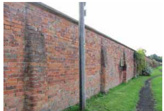
Walled kitchen garden, Holyoakes Lane