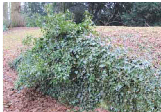
The Icehouse, Hewell Park

The recent sale of some of the properties within the village to individual occupiers has raised concerns that these buildings may suffer alterations which undermine their architectural importance. The imposition of an Article 4 Direction was considered which would remove permitted development rights from some buildings. This means that planning permission would then be needed for any external alterations on elevations fronting the highway. This option was considered, however PPS5 advises that an article 4 direction should only be applied where permitted development rights undermine the aims for the Conservation Area. The level of past alterations is minimal and the risk of significant decay in the near future is low, therefore it was decided not to apply an Article 4 Direction at this time but this could be reassessed in the future.