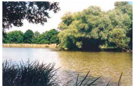
The lake, Hewell Park, ©Parklands Consortium Ltd 2001