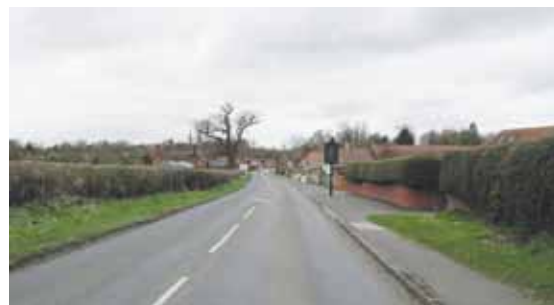
Hewell Lane, looking north-west

There are a number of key views across the landscape which demonstrates the intrinsic value of the historic park and its relationship with the historic buildings on the estate. Prominent views through the village include from the crest of Hewell Lane at the listed water tower down past the Home Farm (now Tardebigge Court) to the Tardebigge PH, and from the opposite direction leading from the listed gate lodges towards the pub. Within what is now Crown land, the approach to the Grade II listed Hewell Grange through the listed gate piers is of high significance along with the views from the garden elevation of the Grange through the French Garden. Views of the water tower up the grass steps have landscape significance as well as contributing to the setting of the listed tower, but have unfortunately been undermined by the loss of some of the steps which originally led as far as the lake. Other views include the grouping formed within Home Farm and the relationship between the various ancillary garden buildings, particularly within the Quarry Garden up towards the Grange beyond. The key views within the proposed Hewell Grange Conservation Area have been identified on Map 1.