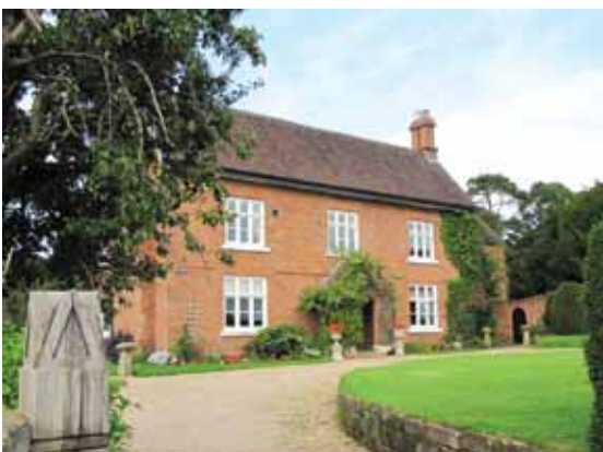
Hewell House, Hewell Lane

A number of interesting historic buildings survive within Tardebigge, relating to the ancillary uses once part of the Hewell Estate. Only one of these is statutorily listed, Hewell House (former Estate Stewards House) and is a mid 19th century re-working (1857) of an earlier 18th Century house with 1930's extensions. The building is a two storey red brick house with tiled roof and timber casement windows and is now in private ownership. Home Farm adjacent (now Tardebigge Court) is unlisted, and was built in 1844 with various later additions over the next 40 years. This complex of mostly single storey red brick buildings is now in use as small workshops and retail units. The long sandstone wall at the boundary of the complex has significant streetscene value.