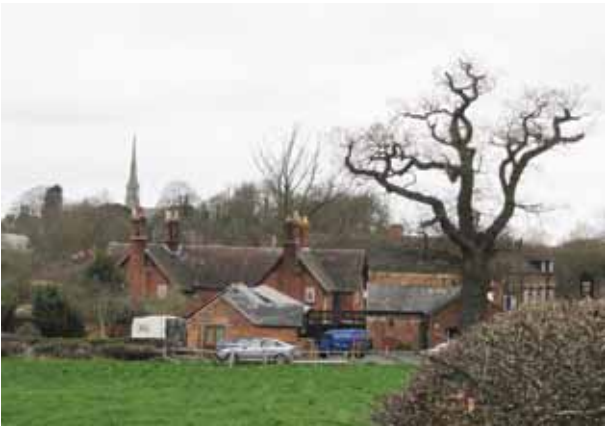
View across The Forge to St. Bartholomew's

Tardebidge as a settlement can be traced back to the 10th century and various versions of the name are recorded. The name can be translated as 'tower on the hill' - a possible reference to an earlier ecclesiastical building on the site of St. Bartholomew's Church. The majority of the manor including the previous church was given to the Cistercian Monks at Bordesley Abbey c.1138 and reportedly grew to a much larger settlement through the medieval period. The medieval church was demolished in 1775 and replaced with the current Grade II listed church in 1777 incorporating much of the earlier fabric.