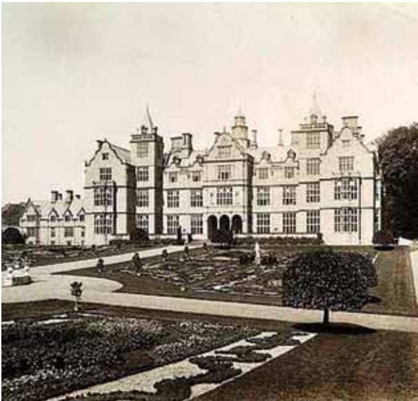
Hewell Grange garden front 1891, H. Bedford Lemere. Reproduced by permission of English Heritage. NMR