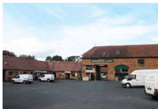
Tardebigge Court, Hewell Lane

The primary use of the buildings within the village is residential, with office and workshop units in the former Home Farm and forge opposite. As the bulk of the historic park is within Crown Land the current uses are associated with the prison including various service, storage and farm buildings. This at least reflects the historic nature of the Hewell estate combining a primary country residence with ancillary working buildings which supported the Earls of Plymouth and housed estate workers.