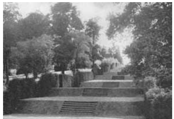
Grass steps to water tower, date unknown.