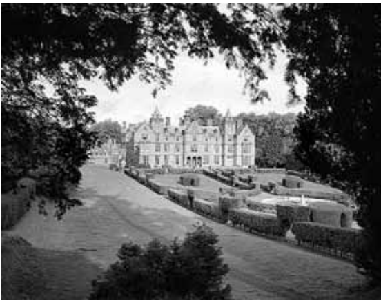
Hewell Grange garden front 1905.

The gardens and park at Hewell Grange are in fact the most recent manifestation of a history of landscaping undertaken at the behest of the Earls of Plymouth. Among the most outstanding elements of the history still visible on the site are the improvements to the lake undertaken at the advice of William Shenstone; the lakes later remodelling with extensive tree planting undertaken by Lancelot Brown in the second half of the 18th century and the continuing enhancement of the pleasure grounds and park in the early 19th century by Humphrey Repton. The improvements also embrace the architectural improvements undertaken after 1815 by Thomas Cundy (Snr), firstly to the house and possibly including the creation of the Real Tennis Court. Further ornamentation to the pleasure grounds and the creation of extensive formal gardens were completed during the 19th century, culminating in improvements undertaken at the end of the century and beginning of the 20th century in conjunction with the design for the new house by Bodley and Garner, constructed between 1884 and 1891. Much of the historic design in terms of circulation patterns, structures, details of surface finish, planting and water features, has been eroded, replaced, or is in poor condition