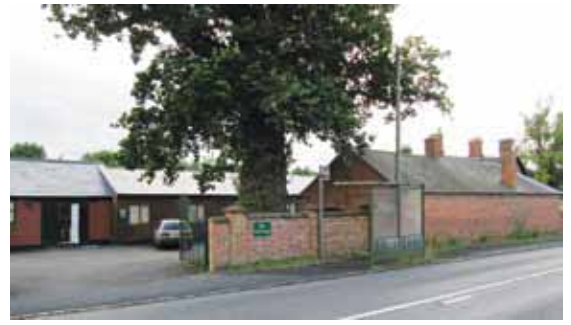
The Forge, Hewell Lane

Directly opposite Home Farm is a range of single storey, 19th century red brick workshops originally a Stables, Pickling Tank, Wheelwrights Shop and Blacksmiths Forge. The buildings were recently renovated and converted to office use. Beyond this heading northwest is a small terrace of three cottages which replaced an earlier structure once called New Cottage. Rose Cottages date from 1856 and are two storey red brick cottages which retain their diamond pattern leaded windows, tall chimneys and central porch to front. Further along Hewell Close is a later two storey red brick dwelling now known as New Cottage, which makes a neutral contribution to the Hewell Grange Conservation Area.