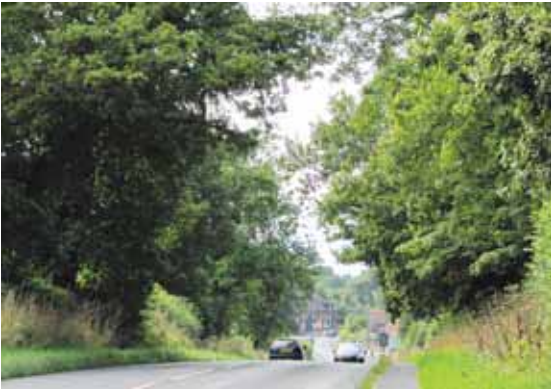
View from water tower towards Tardebigge PH

This is a consultation draft of the character appraisal for the proposed Hewell Grange Conservation Area. Comments are welcome and should be sent to the Strategic Planning Team, Bromsgrove District Council, Council House, Burcot Lane, Bromsgrove, B60 1AA or email conservation@bromsgrove.gov.uk