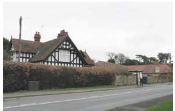
Dairy Cottage and Tardebigge Court