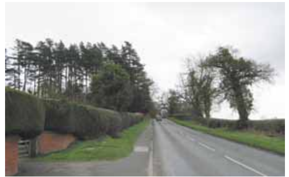
Hewell Lane, from Hewell House looking south-east

2.6 The lake to the north of the proposed Conservation Area is designated as a Site of Special Scientific Interest (SSSI). This designation includes the lake, the eastern and south eastern lakeside woodlands and the mixed ornamental woodlands to the SE of the Grange and SW of the lake. Again this brings no additional planning controls, but consent is needed from Natural England for certain types of works. Part of the SSSI is managed by the Worcestershire Wildlife Trust as a nature reserve because of its importance for breeding and wintering water birds.