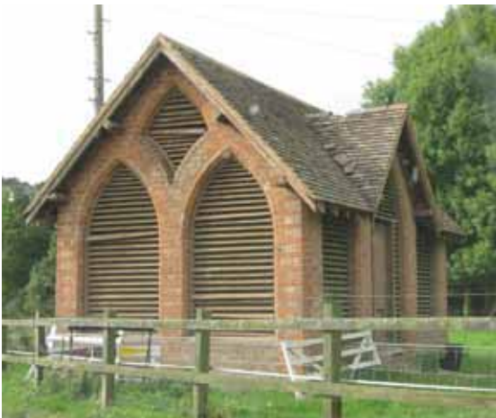
Gamekeepers larder at Hewell Kennels

The Papermill closed in 1817 and the buildings were later converted to residential use and renamed Old Papermill Cottage. The adjacent Old Papermill Cottages incorporate part of an earlier 17th century timber framed building, which was re-fronted and extended in the 18th century and is now four dwellings. Papermill Lodge, across the shared access drive, was built in 1876 and has mock timber framing, leaded windows and decorative plasterwork including the initials of the Windsor family at the upper level.