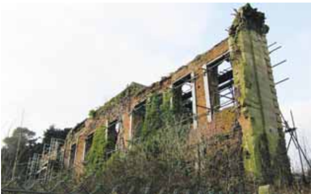
Ruins of The Old Hall, Hewell Park

The main prison building at Hewell Grange is a Grade II* listed former country house built in 1885-1892 to replace what is now known as the Old Hall - itself a remodelling of a 16th century manor house. This large imposing building is in a 'Jacobethan' style popular in the late Victorian period but with an Italianate interior, designed by Bodley and Garner and constructed in Cheshire Red Sandstone. The heavy form of the building is lightened by the large mullioned windows and addition of turrets, ornate chimneys and an octagonal cupola at the upper levels. Most of the lavish interior survives with ornate panelling, decorative plasterwork ceilings and a galleried entrance hall with marble pillars.