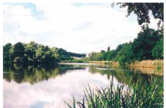
The lake, Hewell Park, ©Parklands Consortium Ltd 2001