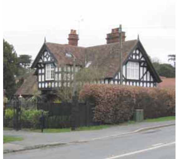
Dairy Cottage, Hewell Lane

On the opposite side of Hewell Lane facing the entrance to Hewell Close are a pair of late 19th century lodge buildings, both unlisted. Southwest Lodge on the left was once the Works Foreman's Cottage and is by Goddard and Paget, who were prominent Victorian architects. Built in 1886, the decorative tile hanging with half timbered gables and carved brackets is typical of the period and the architects. On the right and mostly concealed from view is Dairy Cottage which was built in 1885 and has a slightly heavier style than Southwest Lodge. The single storey dairy building to the rear survives.